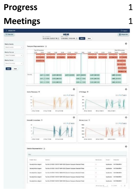
Figure 1 Interactive Forensics Module