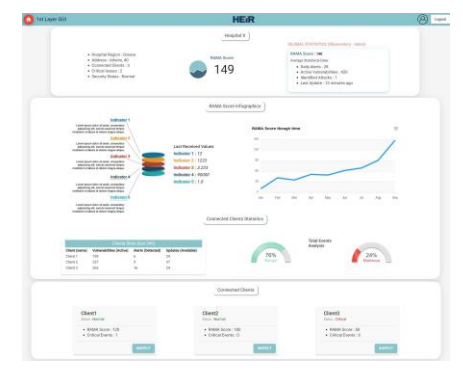
Figure 2 HEIR Client GUI